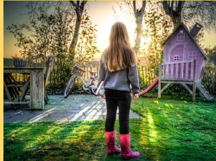
Take your wellies for a walk