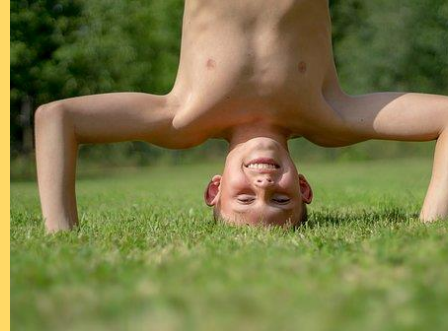
Look from a new perspective