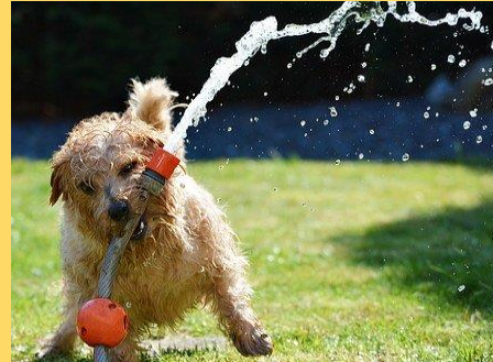
Wash the dog