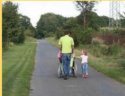
Whizz your wheels