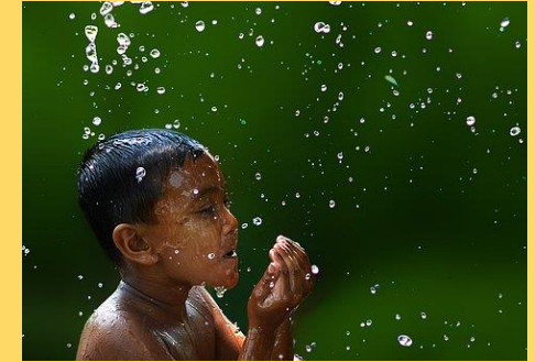
Make a splash