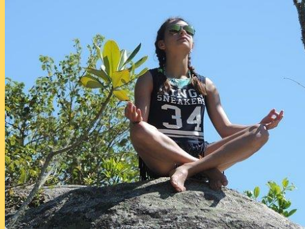
Find your inner self