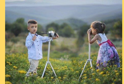
Snap the Spring