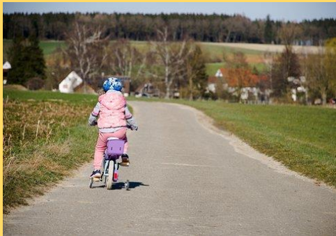
Learn some new tricks