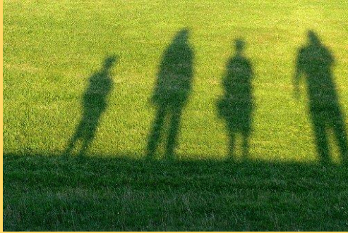
Walk and talk with family