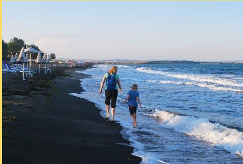
Love your locality