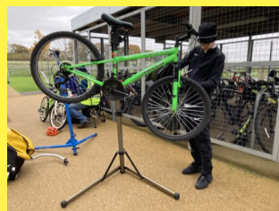
Alfie fixing bikes at Deer Park